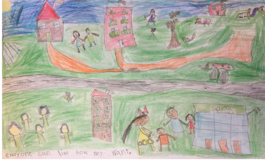
Fair housing through the eyes of a kindergartener at William Ramsey Elementary

where they want to based on how they may look or talk, how they choose to worship, the language they speak at home, or a disability.