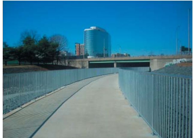
The new trail underpass, which traverses west, under I-395, is set to open in mid-May.