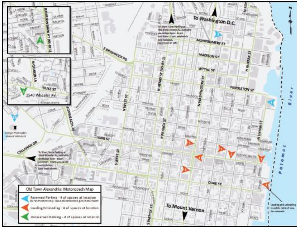
Figure 4: Motor Coach Map