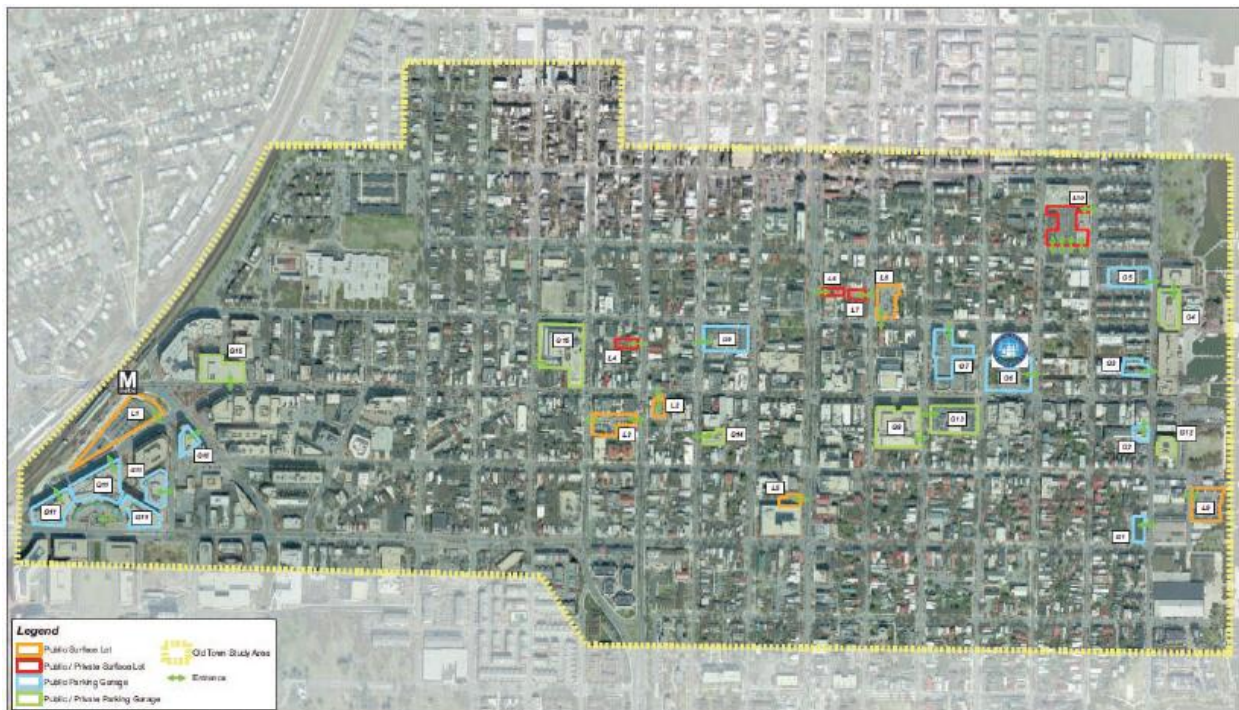
Figure 6: Off-Street Parking Locations ( Old Town Area Parking Study )

When the garages in the waterfront core area are successfully occupied at peak times, additional garage space to the west of the core area along King Street and also to the north of the area in large commercial buildings along the Potomac River can be utilized. The Study identifies some 5,000 parking spaces in