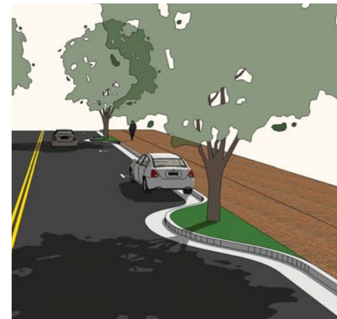
Tree boxes in parking lane