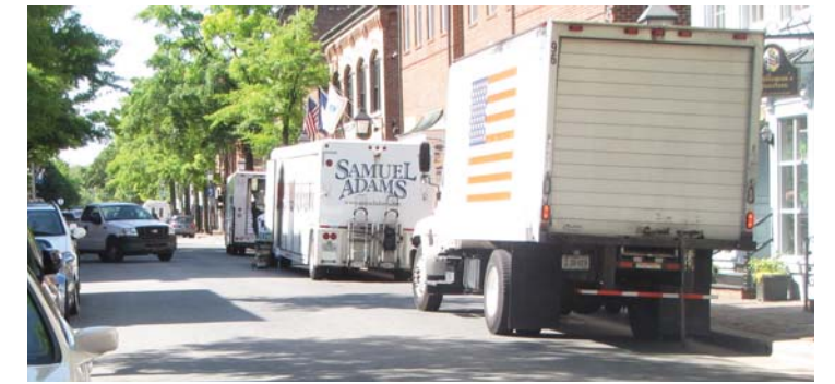
Delivery trucks loading & unloading on Union Street