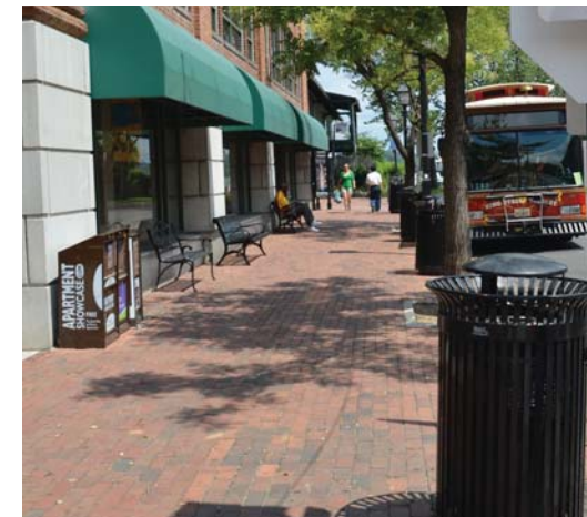
Wider sidewalks on King Street