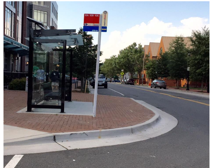
Intersection of Mt. Vernon Avenue and Kennedy Street