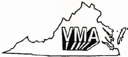
Virginia Motorcoach Association