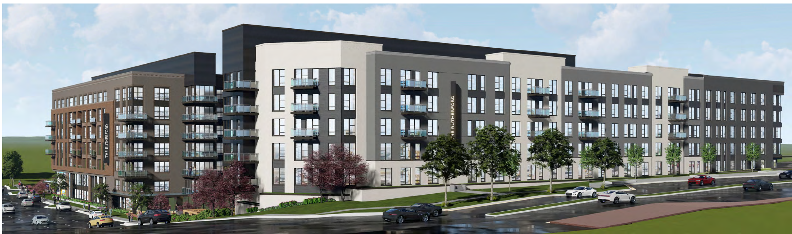
4 - VIEW FROM MARK CENTER AVENUE