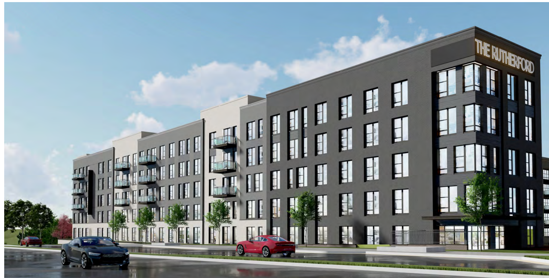
5 - VIEW FROM MARK CENTER AVENUE