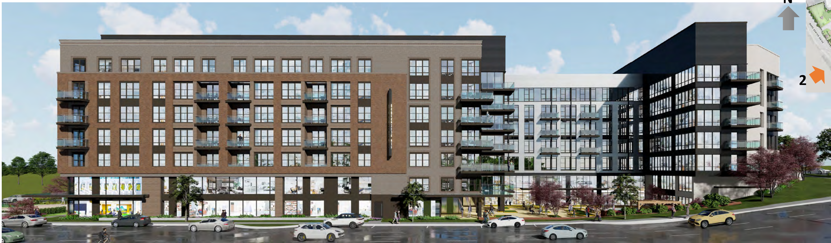
2 - VIEW FROM MARK CENTER DRIVE