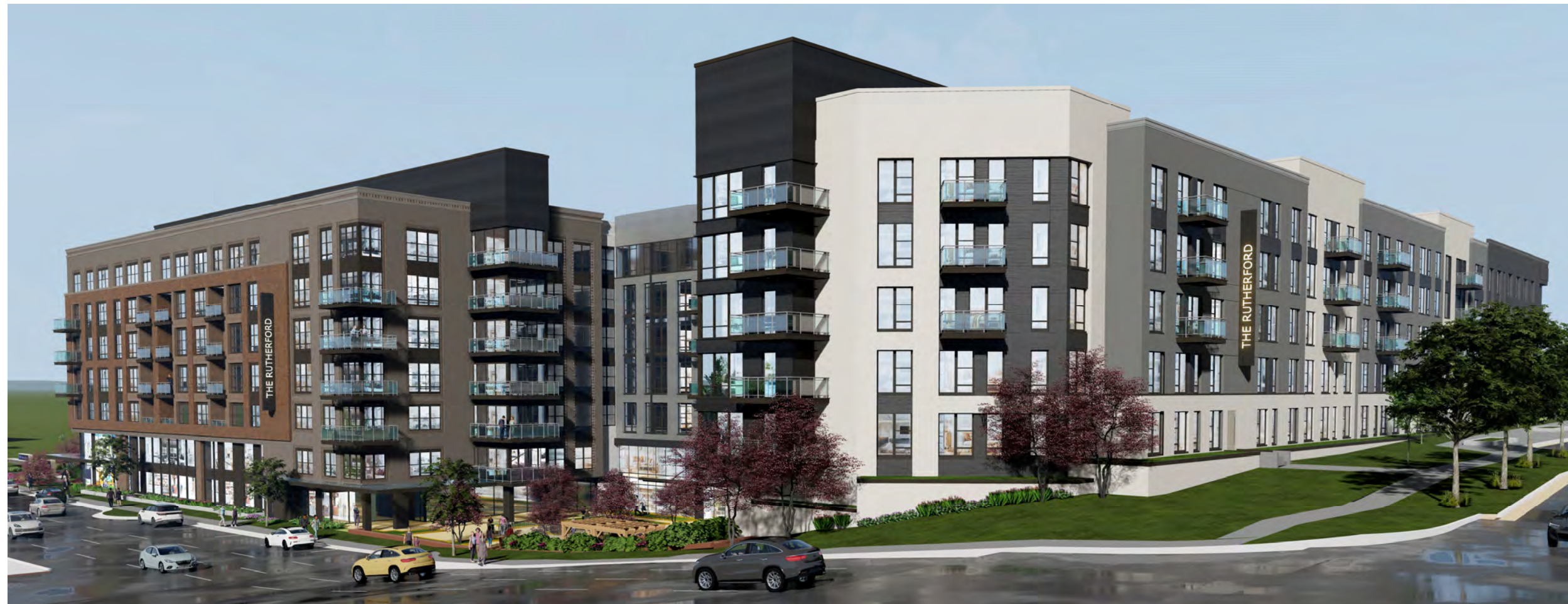
3 - VIEW MARK CENTER DRIVE AND MARK CENTER AVENUE

5000 SEMINARY ROAD LOT 502 CITY OF ALEXANDRIA