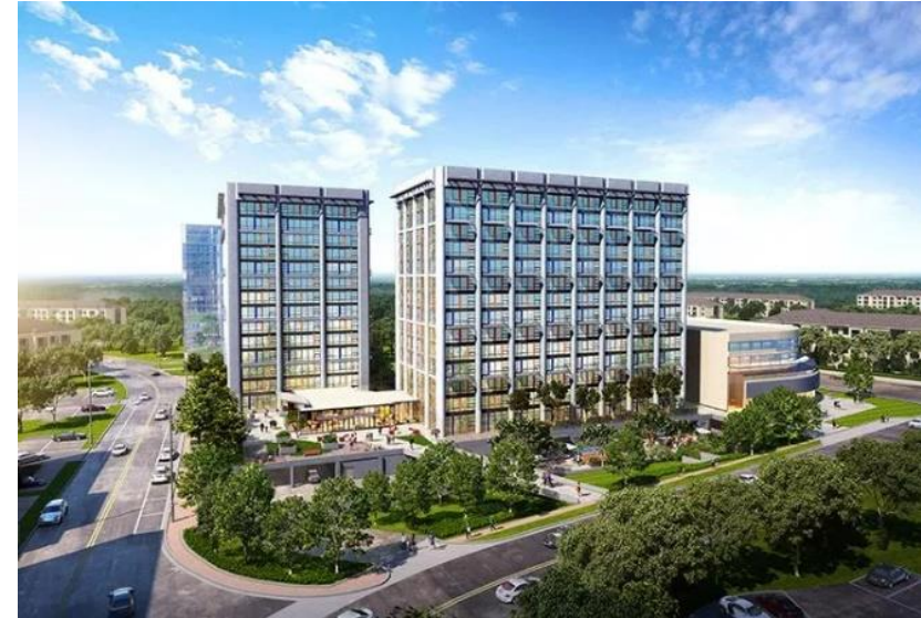
A rendering of the office-to-apartment conversion project at the Park Center complex in Alexandria.