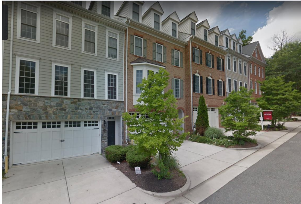
Townhouses on Goddard Way in Alexandria

Townhouses have been a popular housing type throughout Alexandria's history. Alexandria's zoning ordinance allows townhouses in multiple zones, but the rules can be very different depending on the zone. This initiative will seek to create a common set of rules for townhouse development and reduce unnecessary regulatory barriers to townhouse construction within commercial zones.