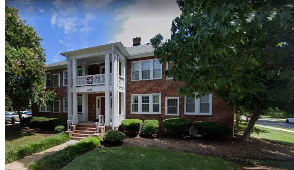
Alexandria Square condominiums, Del Ray

The purpose of this initiative is to identify land use patterns, such as the mix of uses and building types found in historic neighborhoods (Del Ray, Rosemont, Old Town, and Parker-Gray) that can no longer be built under existing zoning. Characteristics of historic land use patterns that are desirable would be identified along with recommendations for changes to the Zoning Ordinance to allow these patterns to be considered.