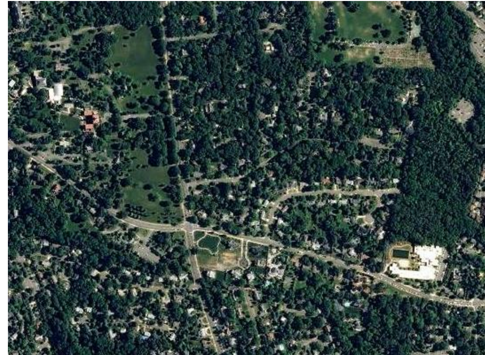
A neighborhood in Alexandria composed of single-family detached homes