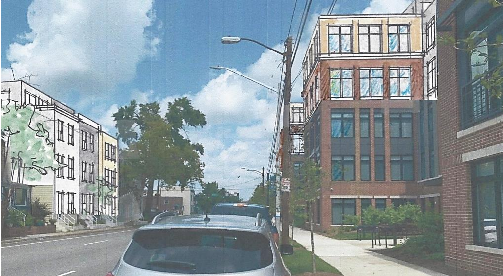
Visual depiction of “bonus height.”

This initiative would incentivize more use of Section 7-703 of the zoning ordinance that allows additional height in new residential projects in exchange for affordable housing. Current law allows the provision to be used in areas with a height limit greater than 50 feet, and the proposal is to allow it to be used in areas with height limits of 45 feet or more. A goal of the initiative is to expand housing choices and dispersion throughout more areas of the City in a manner that is harmonious to the surrounding physical context of the community.